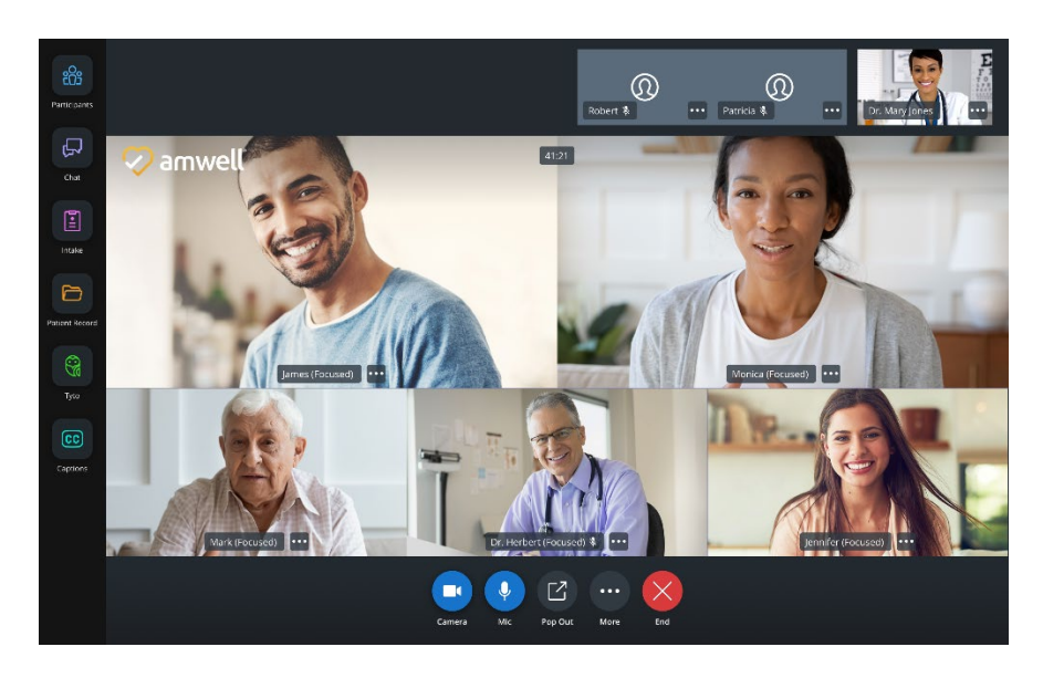
Pinning in Default View (Desktop)

Note : None of these behaviors affects all participants. When you Pin a participant, it only affects your view of the video console and no one else's.