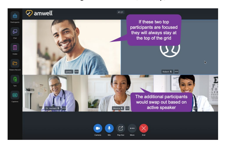
Pinning in Grid View (Desktop)