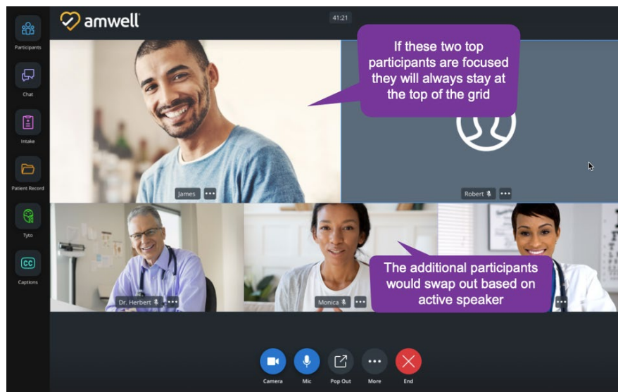
Pinning in Grid View (Desktop)