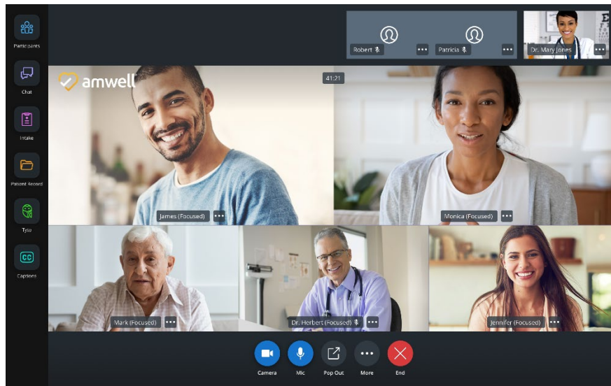
Pinning in Default View (Desktop)

Note: None of these behaviors affects all participants. When you Pin a participant, it only affects your view of the video console and no one else's.